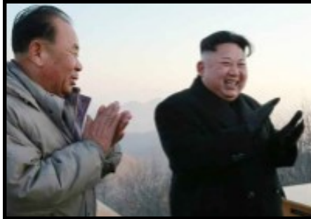
North Korean leader Kim Jong Un applauds the successful missile test earlier this month. The missile landed in Japan's economic waters, about 200 yards from a Japanese shoreline.

"I'm not really that worried because even if it seems like the U.S. isn't doing much, they are proba-