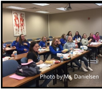
Eighth graders explored different career opportunities offered through science earlier this week.